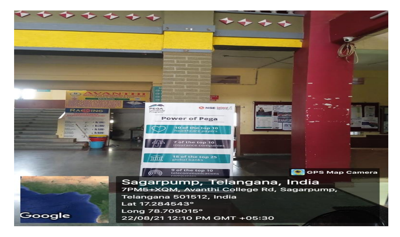
CC-Camera at Entrance, main block