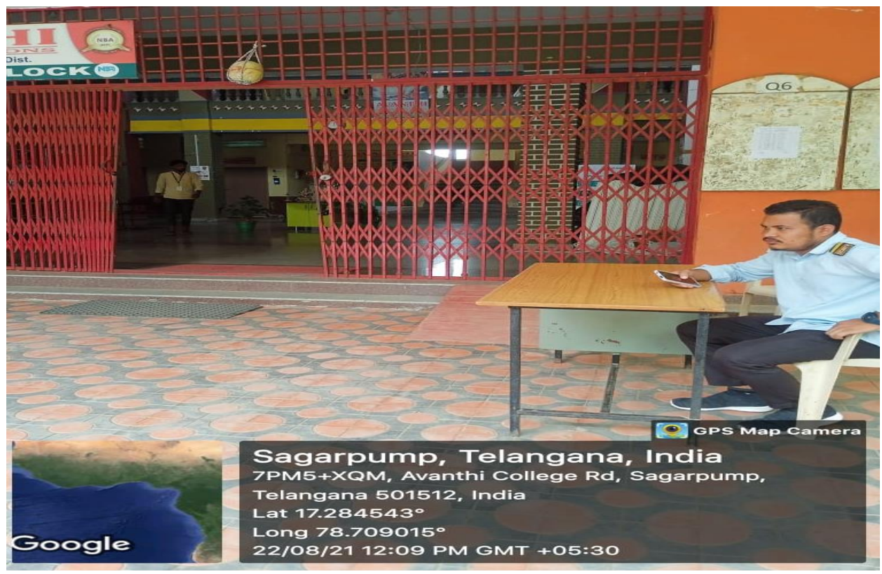
SECURITY AT MAIN BLOCK