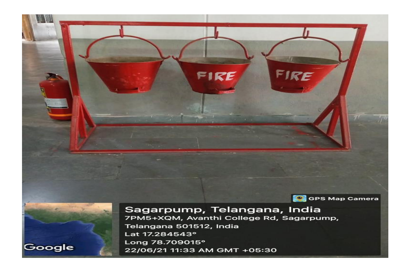
fire extinguishers at Ground floor