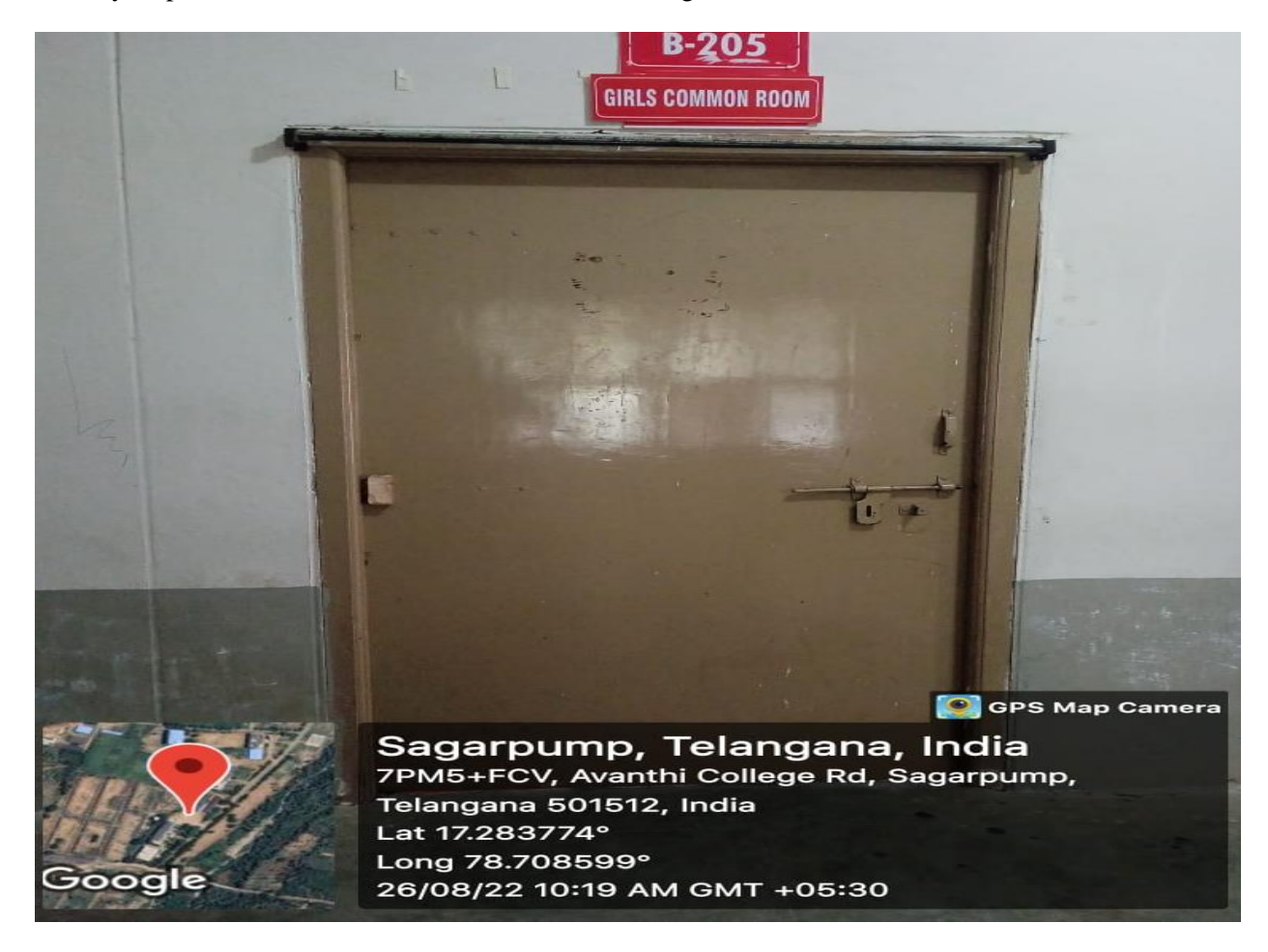
Women Waiting Room at First Floor, EEE building

Sanitary Napkin, first aid kit is available in rest room for girls.